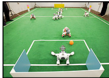
During a game of AIBO (artificial intelligence robot) dog soccer the Georgia Tech goalkeeper spread eagles to attempt to block the shot of his a robot dog from the University of Texas during the Robocup U.S. Open Competition at Georgia Tech in Atlanta, Monday, May 9, 2005. The robot dogs were acting fully autonomously using artificial intelligence instead of remote control operation from a human. The competition was founded to foster and promote research in artificial intelligence and robotics.

The dogs by default are programmed to act like pets, but when